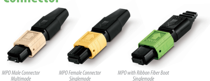
MPO Male Connector Multimode