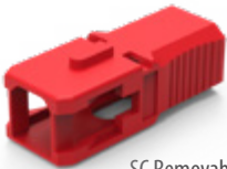
SC Removable Polishing Housing

IPSDC2 - SC601 - 4.8 - D ORDER CODE example