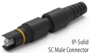
IP-Solid SC Male Connector